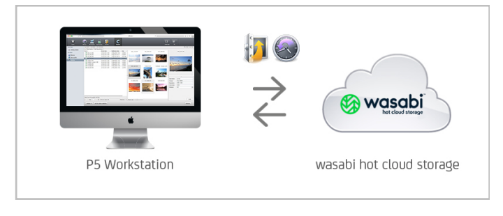
P5 Archive and P5 Backup to Wasabi hot cloud storage

P5 Backup and P5 Archive quickly copy or move data to Wasabi for durable protection at the lowest-possible cost. Backed up or archived data is first saved to local disk-based volumes, which are then backed up or archived to Cloud storage. Individual parts of the volume can be copied or downloaded, without the need to restore the entire volume as a whole. The local disk-based volumes can either be deleted automatically, or kept as a separate local copy to speed up restores. For a rapid restore, Wasabi provides immediate access to archived or backed up content.