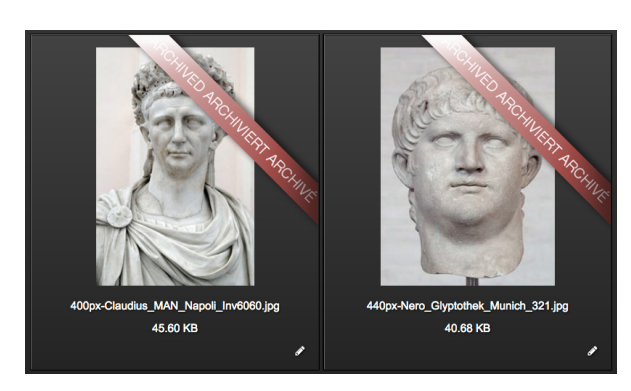
Archived assets in the cavok interface

Peak 14's DAM-System cavok revolutionizes media asset workflows. cavok is the first to provide Master Media Management, a central, sustainable management solution for all media and connecting systems in a company's environment. It is fundamentally designed so that it can easily be combined with CMS, PIM, ERP systems, online shops and more. These connections create countless possibilities for the automation and simplification of workflows. Thereby, users can easily monitor activities and avoid media disruptions, unnecessary duplicates and redundant work processes.