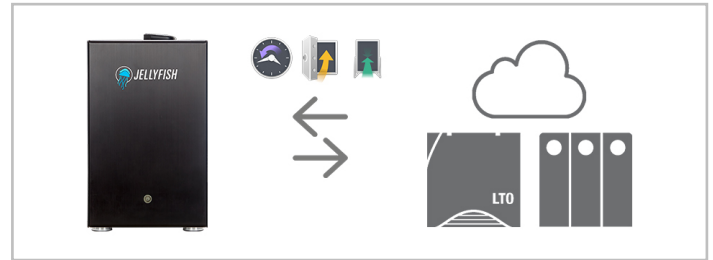
P5 Archive, Backup and Synchronize from Jellyfish

P5 Backup creates security copies of files and projects so they can be restored in case of accidental deletion, file corruption, or technical failure. At least one of these periodic security copies can and should be kept offsite, so data is safe even in case of natural disaster.