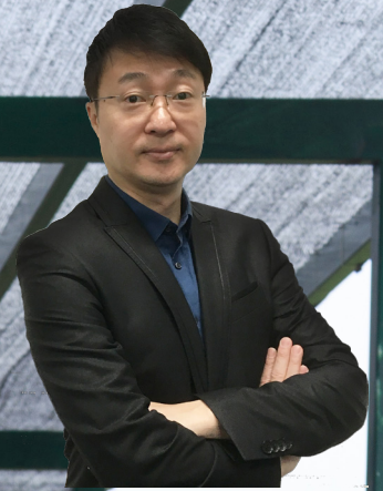
B-Free Technology Limited Most Innovative Mobility Solution – Hong Kong